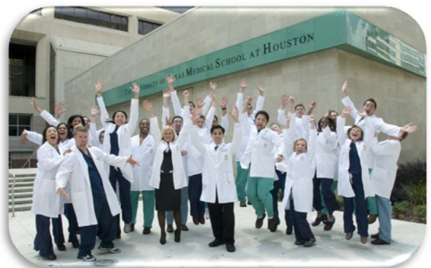
2011 Graduating Anesthesia Residents