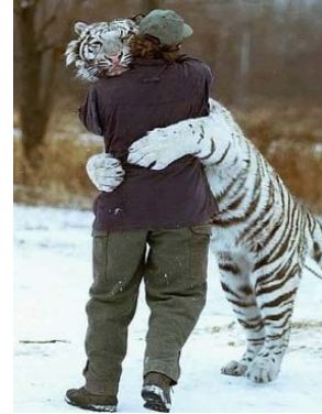
Going to miss you, man.