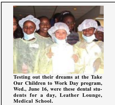
Testing out their dreams at the Take Our Children to Work Day program, Wed., June 16 , were these dental students for a day, Leather Lounge , Medical School.

The Medical School Research Retreat next October 15 - 16 has drawn 146 registrants.