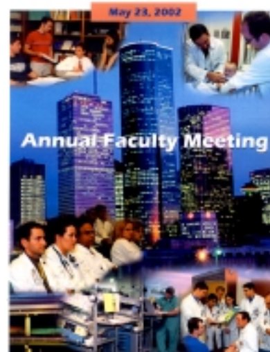
Annual Faculty Meeting handbooks are available in MSB 6.119.

Copies of the Annual Faculty Meeting handout are available in MSB 6.119. A videotape of the meeting soon will be available to be checked out at the Learning Resource Center.