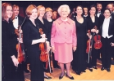
Doctors Orchestra of Houston members with guest narrator, Barbara Bush, center, on Feb. 23, '02.