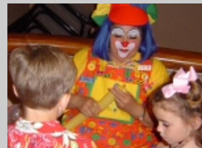
"Confetti" the clown entertained the younger set at the picnic.