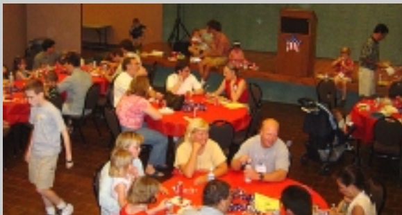
Alumni and relatives gathered for an informal picnic in the Fifth Floor Gallery Sat., May 17.

Former classmates and their families from around the country were drawn to the May 16-17 event.