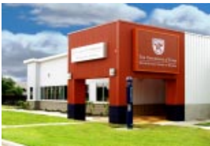
The new Recreation Center at 7779 Knight Road opened June 7.

Join up, get fit, and preserve and improve the Medical School Fitness Center (MSFC). That's the message the Dean's Office, in collaboration with the University Classified Staff Council (UCSC), want to convey as they spread the word with a Health Science Center campaign.