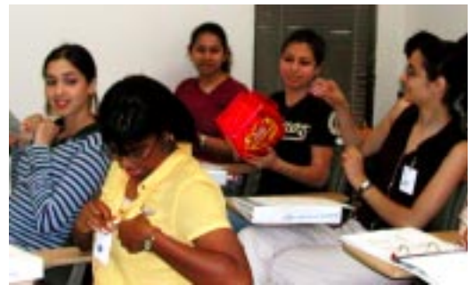
Students in a lighter moment during their Summer Research Program class.