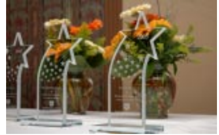
30-year STAR awards grace the reception table.

The 2005 STAR Awards luncheon March 2 honored more than 600 employees for their service to the health science center. The following Medical School recipients were recognized: