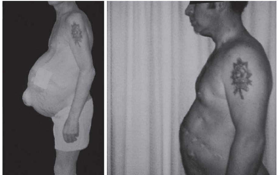
Fig. 2. Patient with alcoholic cirrhosis before and after 3 years of abstinence.