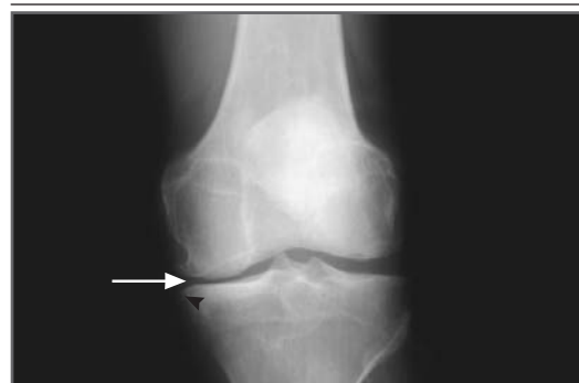
Figure 2. Radiograph Showing Osteoarthritis of the Medial Side of the Knee.

For treating the pain of osteoarthritis of the knee, head-to-head randomized trials showed that nonsteroidal antiinflammatory drugs (NSAIDs) and cyclooxygenase-2 (COX-2) inhibitors are more efficacious than acetaminophen. 19,20 However, the superiority of NSAIDs over acetaminophen (at doses of 4 g per day) is modest. 20 In one large crossover trial, 19 the average reduction in pain during the first treatment period, on a scale of 0 to 100, was 21 in patients treated with NSAIDs and 13 in those given acetaminophen ( P < 0.001 ). Because of the greater toxicity of NSAIDs, acetaminophen should be the first line of therapy. Acetaminophen appears less effective, however, among patients who have already received treatment with NSAIDs; in the crossover trial there was no improvement overall with acetaminophen in patients treated after a six-week course of NSAIDs. 19 Low doses of antiinflammatory medications (e.g., 1200 mg of ibuprofen per day) 21 are less efficacious but better tolerated than high doses (e.g., 2400 mg of ibuprofen per day). 22 One strategy to decrease the potential gastric toxic-