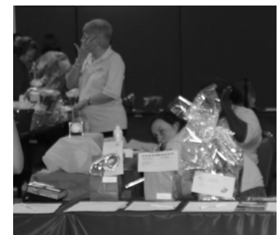
The ever important silent auction for scholarship funds