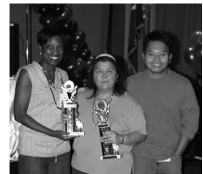
Yeah, more winners!