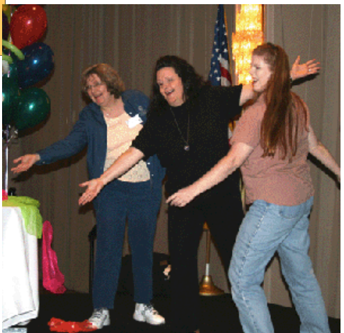
Workshop attendees wore ribbons and clothes in orange and maroon in support of Virginia Tech.