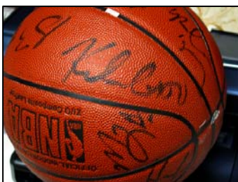
Kelvin Cato #13 Steve Francis #3