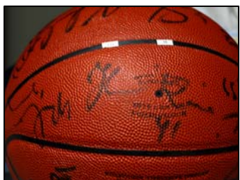
Glen Rice #41