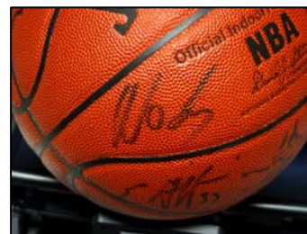
Eddie Griffin #33 Cuttino Mobley #5